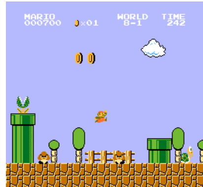
Figure 1: Mario Man can had 000700 points. Mario Man will points by stepping in Goomba or Shell People.

Copyright 209X ACH X-123456-XX-1/04/07 ...$5.00.