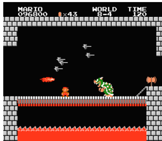
Figure 4: Go For It Mario Man ! If You Get Bowser King of The Shell People In Lava Then Color Graphs !

Mario Man gets at the Paint Store Ave. he could put on a graph to color it: please seen on FIGURE 3. Q.D.E. □